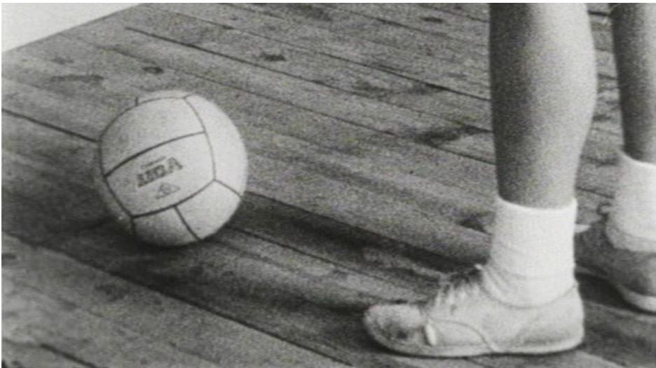
Volleyball (Foot Film), 1967