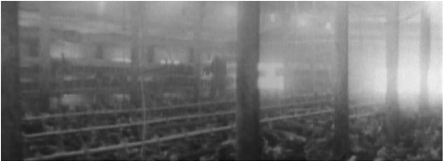
Rhode Island Red, 1968

wrote in 1966 that what she was aiming for in her dances was a quality of movement resembling the way “one would get out of a chair, reach for a high shelf, or walk down stairs.” 21