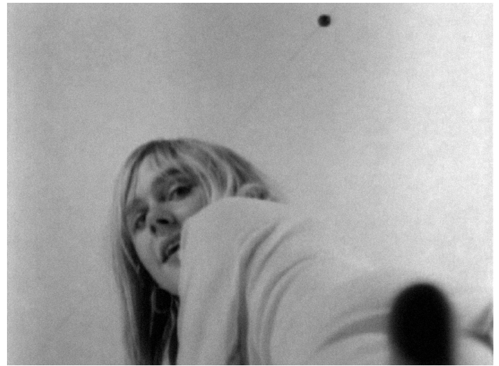
Line , 1969