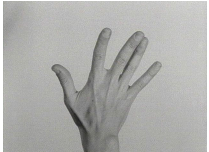
Hand Movie, 1966