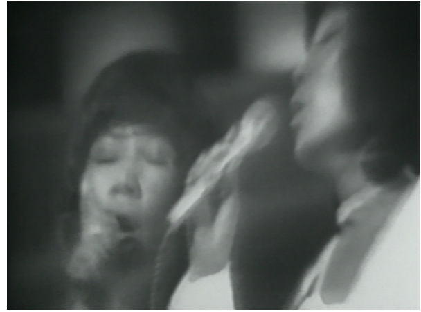
My Father (1973-75), Shigeko Kubota